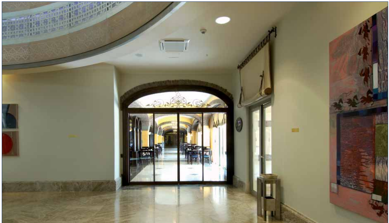
Hotel Kempinski, Antalya

Powerful motor with 400 Ncm and encapsulated gear, low-noise.